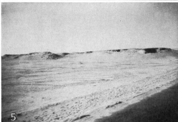
Abb. 1: Postpluvial Dead Sea terraces (with embankment of Jericho road in left foreground)