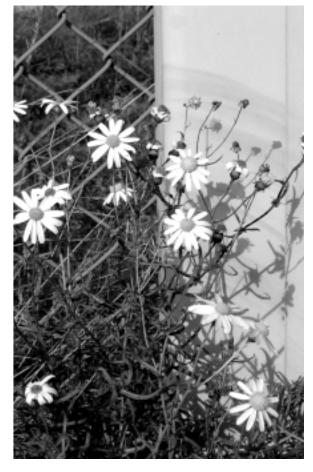
Photo 1: Senecio inaequidens DC. in Fuerth/Bavaria (near Nuremberg, 2001)

Population growth is in any case not possible if the descendants do not find suitable sites for establishment in the vicinity of the founder individuals. For S. inae-quidens , the preference of anthropogenic sites has led to