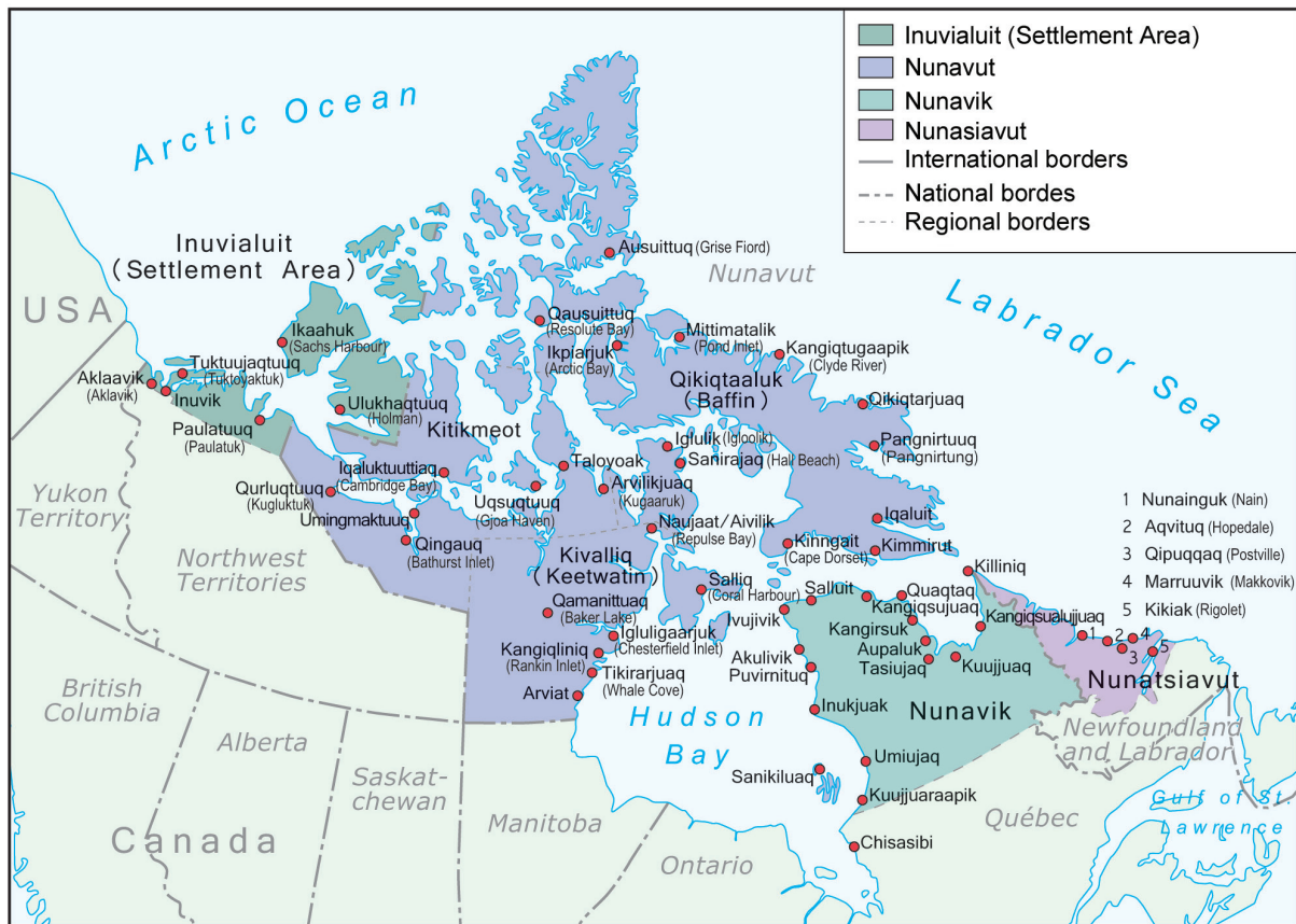
Fig. 1: Inuit settlements and settlement regions in Canada.

ment projects in the Inuit settlement areas (INUIT TAPIRIIT KANATAMI 2004, 3; SAKU and BONE 2000a, 284). The intended outcome is to enable the Inuit to continue their traditional activities and lifestyle while facilitating their integration into the modern Canadian economy as a way to improve living conditions and to reduce high unemployment rates in northern communities (SAKU and BONE 2000a, 294; SAKU and BONE 2000b, 262–263).