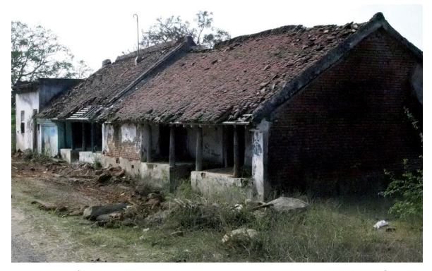
Photo 2: Abandoned house in Ullavur village

social exclusion intersect; there is little on the politics of space; and there is nothing on environmental issues and how they emerge in spatially contingent ways. We regard these absences as major omissions – paradigmatic blind spots that arise because of the way that certain forms of evidence and approach are privileged over others" (RIGG et al. 2009, 132–133).