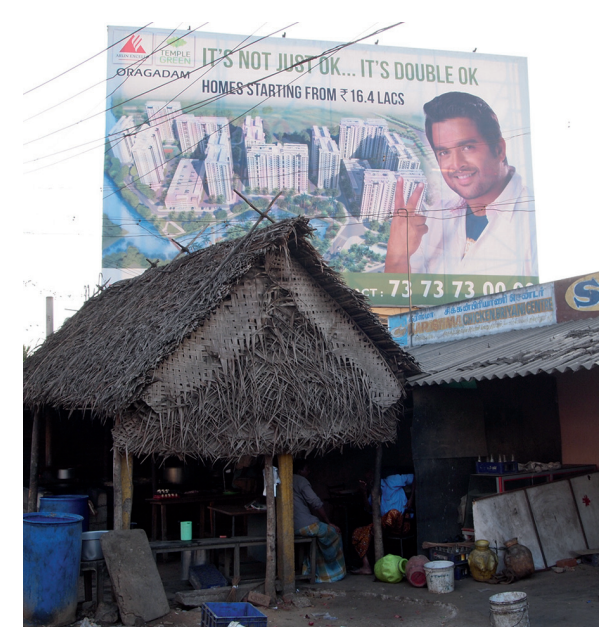
Photo 1: Advertisement for apartments and street food seller near Sriperumbudur.

In the village of Ullavur, for example, the original price offered in 2006 was about 500 rupees/cent (about 8 Euro for 40 m<sup>2</sup>). Then offers were quickly raised to 5000 rupees/cent, and finally between 10-12000 rupees/cent were paid (about 4 Euro/m<sup>2</sup>) when the land in nearby Oragadam was taken over by SIPCOT. The land brokers made enormous profits out of their commissions. The "dalit" groups usually remained in their old segregated villages, without any access to the land resources that had remained. As many of the landless regarded themselves as the legal traditional occupants of "communal" lands, numerous conflicts and clashes emerged around land issues. The newspaper "The Hindu", for example, reported on legal challenges to land acquisition in Oragadam (The Hindu, 03.05.2011) and many NGOs speak out against SEZs (SPMEI 2008).