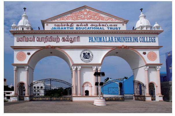
Photo 3: Engineering College near Sriperumbudur

The exclusion of environmental considerations profoundly limits the analytical scope of the approach applied in the Report. This section reflects on some ecological effects of the industrial transformation in