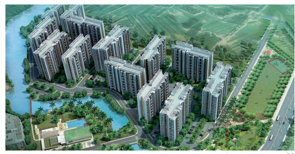
Fig. 2: TEMPLE GREEN layout projection.

From 2004 to 2009 alone, according to Times of India (05.09.2009), foreign investments in Sriperumbudur and neighbouring Oragadam summed up to more than 2.8 billion US-$, just for the eight largest industrial plants in this corridor.