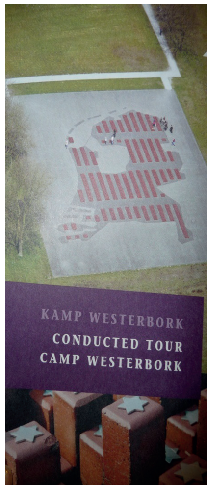
Photo 4: Cover page of the Westerbork brochure picturing the open-air monument at the camp-site. Red brick tiles are in the form of barracks and the entire constellation depicts the Netherlands map: national territory

In addition, the “Jerusalem Stone” was given as a gift in 1993 from Israeli President Chaim Herzog, in the presence of Dutch Queen Beatrix “in memory of the victims of Nazi terror and Westerbork”; “similar stones were also placed in Auschwitz and Bergen Belsen” ( KAMPWESTERBORK ). In 2001, a series of commemorative plaques designed by Victor Levie were unveiled near the entrance to the former camp by Jules Schelvis, one of eighteen Dutch survivors of the Sobibor, and former Prime Minister Wim Kok. Each plaque lists the destinations of extermination camps Westerbork inmates were sent to – Sobibor, Mauthausen, Bergen-Belsen, Auschwitz and Theresienstadt – as well as shows the numbers of deportees and victims ( ibid ). Other subtle signs and well-known Holocaust symbols are to be found in Camp Westerbork, perhaps to convince the visitor that real people with their families were once here before being transported to their death. A series of much less than life-size concrete barrack markers are located on the historic sites, mostly covered with mounds of snow in winter (Photo 2). Along the pathway, glass plaques are irregularly scattered throughout the empty camp scenery with (we assume reproductions of original) letters and