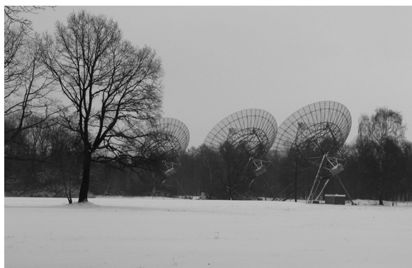
Photo 3: Empty space at camp heritage site with radio telescopes.

More recent memorials include “102,000,” an installation of brick-colored stones topped mostly by Stars of David; about 200 have flames to represent Sinti and Roma, and 100 have no symbol to represent resistance fighters. Because there are no remains or final resting place for survivors and their families, “the