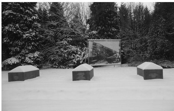
Photo 2: Forest around contemporary Westerbork heritage site

25 meters in height, stand on the right side of the memorial ground (Photo 3). Westerbork remains a unique “hot spot” in astronomy and space research due to the remoteness of the location. The distance from traffic and other airwave signals was one of the main reasons why the telescopes were erected at this location, in addition to the availability of large area of “empty” land. The presence of these monumental telescopes shifts one’s more inward and attentive focus on learning about the history of the transit camp back to the present-day. We are reminded of the ways the past and present always co-exist in one location, even if these are not formally ‘signed’ in the landscape.