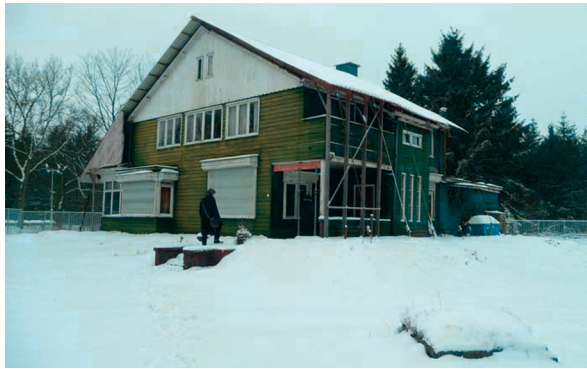
Photo 6: The old Commandant's house in camp Westerbork

that the wooden villa of the camp commander has remained standing, whereas a fire in Veendam in 2009 destroyed the barracks in which Anne dismantled batteries. 'It is a cruel twist of history that the residence of the camp commander still stands', the website of the Westerbork Camp states. It is, however, not history but human actions and failures that are responsible for this' (JANSEN 2015, 201). A form of commemorative competition has also emerged on the terrain. As if to reclaim the significance of the voices of those who suffered during the war, on the occasion of the 70 th anniversary of Westerbork's liberation, a new "speaking memorial", Voice Names , was launched in Spring 2015 (Dutch Online News 2015; RTV Drenthe 2015). This sound installation includes the names of former prisoners (Jews, Sinti and Roma, and resistance fighters) and selections from the diary of camp-prisoner Philip Mechanicus within two restored original train cars that regularly departed Westerbork to go to extermination camps during 1942–1944. Located on a piece of rail on "The Ramp" this sound sonic memorial adds a new aesthetic element to the original memorial complex that claims its authenticity through artefact, historic location, and Holocaust memorial iconography.