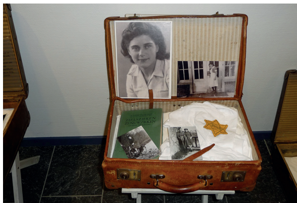
Photo 1: The stories of Jewish inmates in Westerbork Memorial Center (Photo: KUUSISTO-ARPONEN, January 2013)

The exhibition space includes suitcases, family photos, reproduced and some original postcards and letters, and other small personal items (Photo 1). The politics of artefact representation (ALDERMAN and CAMPBELL 2008, 345) are used to depict an embodied experience of what a transit camp might have looked like for the visitors. The visitor can move around this space in whatever direction s/he chooses and examine the objects on display; the amount of information is not overwhelming and there are spaces to take a break (and to sit down). Despite the seriousness of the topic, one does not often see visitors in the exhibition space crying or distressed; we believe that this may be related to the design of the exhibition space which is open overhead and does not have sections with dark lighting. Moreover, the content of the exhibition is appropriate for children, young people and adults, which means that no visual images of bodily violence or death are depicted. Toward the end of the main room, the visitor wanders “into” an “original” (reconstructed, partially built) barracks; after going “through a door” into this space