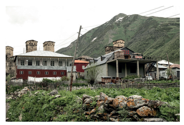
Photo 5: A 1960s residential building, whose core dates from the medieval period and which has been transformed from its original shape by processes of renovation and extension

Restructuring of traditional agricultural methods in the context of collectivisation after 1951: replacement of cereal crops by potatoes, increased livestock holdings, family-owned property being taken over by the state, etc.