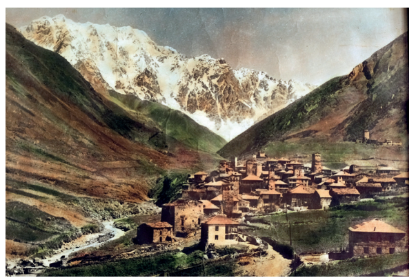
Photo 2: Reproduction of an undated photograph from the 1960s, showing Chvibiani and Zhibiani and taken from a room of the Solomon guest house in Chvibiani, which captures the principal phase of reconstruction during the Soviet period. Older interlocutors have stated that during this phase, over half the village's uninhabited towers were demolished for building materials.