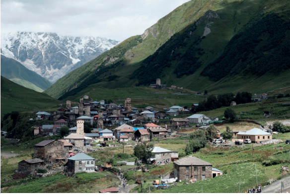
Photo 3: The same view, taken in 2018; a check at the site confirms that since the previous photograph was taken, only one further tower has been lost, to collapse.

elled on hotels and other types of tourist-oriented structures typical of the European Alps (cf. Photo 4 and Photo 5). Further, seasonal returners to Ushguli, who cannot do the work of mountain farmers, do not meet UNESCO stipulations as regards contributing to the preservation of the local cultural landscape (cf. criterion V, ICOMOS 1996).