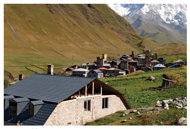
Photo 4: The new building in the foreground is a café and restaurant for tourists constructed in a European Alpine style

(2) 'permanent returners' who resettled in the community in response to the economic crises since the late 1990s, initially to subsist and later, after around 2010, in order to develop a sustained livelihood from services to tourists; (3) 'intermittent returners', who live in Ushguli during the summer months only and have converted their properties and farms to guest houses (see also VOELL et. al. 2016).