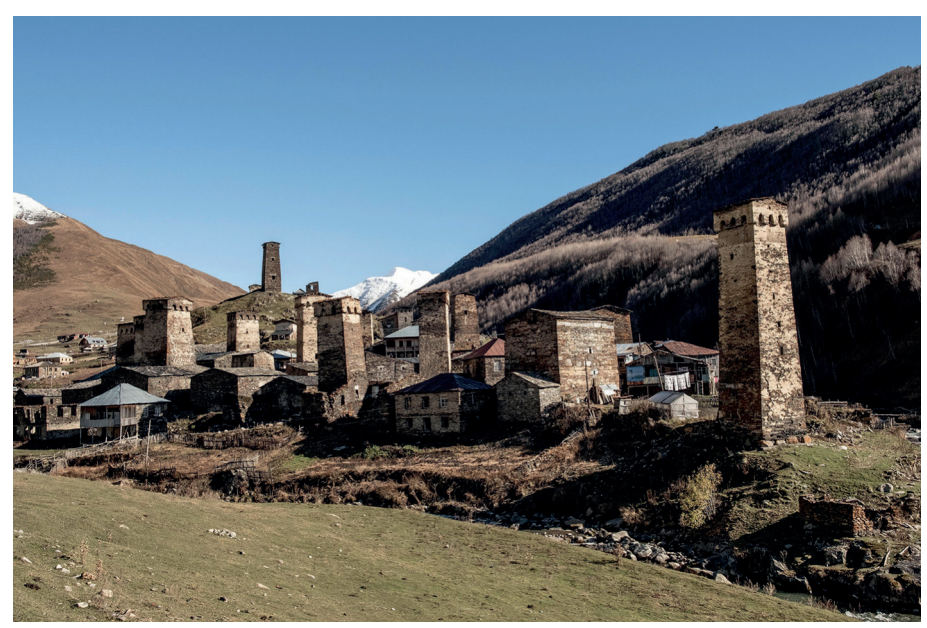
Photo 1: View of Chazhashi, a current World Heritage site which in the Soviet era was known as the Ushguli-Chazhashi Museum Reserve and held protected status from 1971 onward.

UNESCO's rationale for awarding World Heritage status and the current situation on the ground. The risk exists that UNESCO could, as it has in other cases, reduce the geographical extent of Georgia's World Heritage sites or remove the status from an entire architectural ensemble (cf. Stadelbauer 2018, 47f.). Populations in remote mountainous areas, likewise in regions of the Caucasus, generally perceive the rich cultural and ecological heritage frequently found in such areas to hold significant potential for the development of tourism from hikers and culture afficionados (cf. Gracheva et al. 2012). In Ushguli, it appears as if this promise may be at risk of radical reversal due to the threat to the cultural landscape's long-term survival.